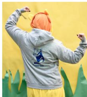
$25 grey Sweatshirt