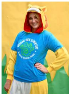
$15 teal T-shirt (back of shirt is blank)