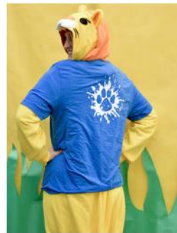
$15 blue T-shirt (runs small )