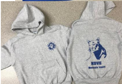
GRAY Hoodie Sweatshirt